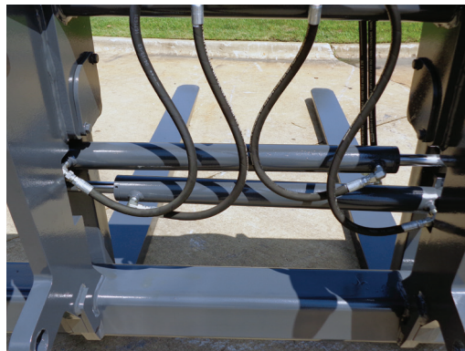
Hydraulic Option Available