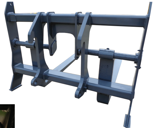
JRB Quick Hitch Mount Standard, Pin-On Mount Available