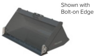
Shown with Bolt-on Edge