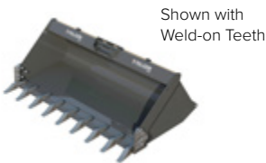
Shown with Weld-on Teeth