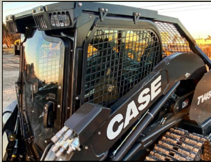
Side Window Guards