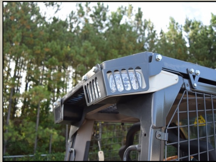
Front Light Guards for Top Guard