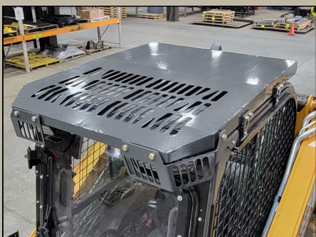
Top Guard w/ Light Guards