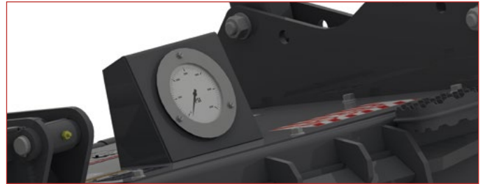
On-board pressure gauge easily viewed from operators station to monitor system pressure (N/S for excavator only models)