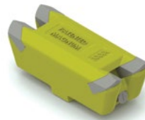
Reversible Carbide Tooth