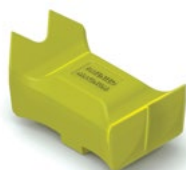
Reversible Claw Tooth