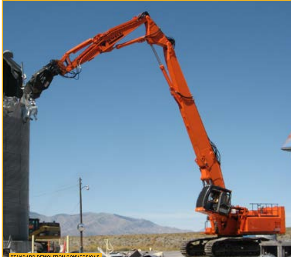
STANDARD DEMOLITION CONVERSIONS

Whether your job requires safely razing a high rise building, tearing down an obsolete factory with a large shear, or reliably handling scrap and demolition material, Jewell can build a machine to meet the task.