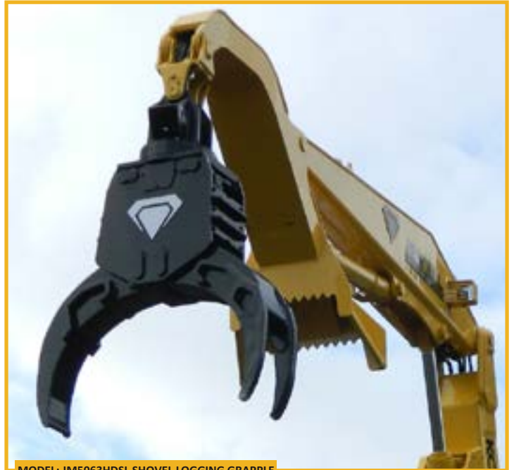
MODEL: JM5063HDSL SHOVEL LOGGING GRAPPLE