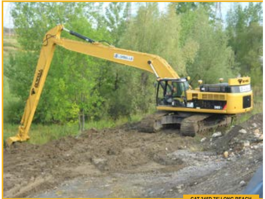
CAT 345D 75' LONG REACH