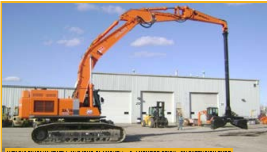
HITACHI ZX450 W/JEWELL MH34BHD CLAMSHELL - 3rd MEMBER STICK - 20' EXTENSION TUBE