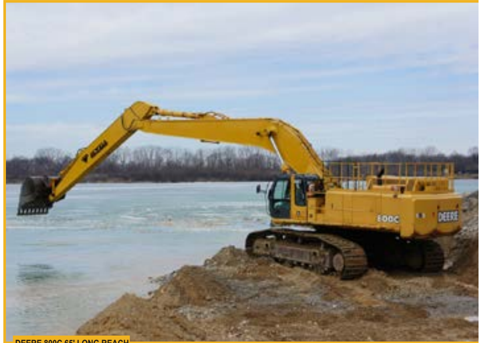
DEERE 800C 65' LONG REACH

Whether your job requires reliably handling scrap, demolition, logging or construction. Jewell can build a machine or attachment to meet the task.