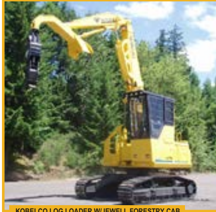
KOBELCO LOG LOADER W/JEWELL FORESTRY CAB