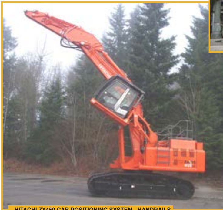
HITACHI ZX450 CAB POSITIONING SYSTEM - HANDRAILS