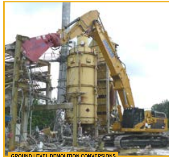
GROUND LEVEL DEMOLITION CONVERSIONS