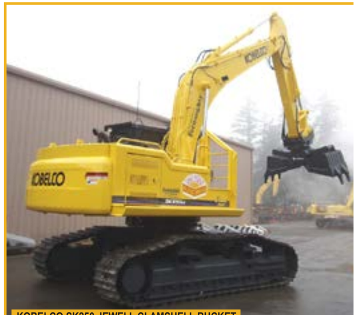
KOBELCO SK250 JEWELL CLAMSHELL BUCKET