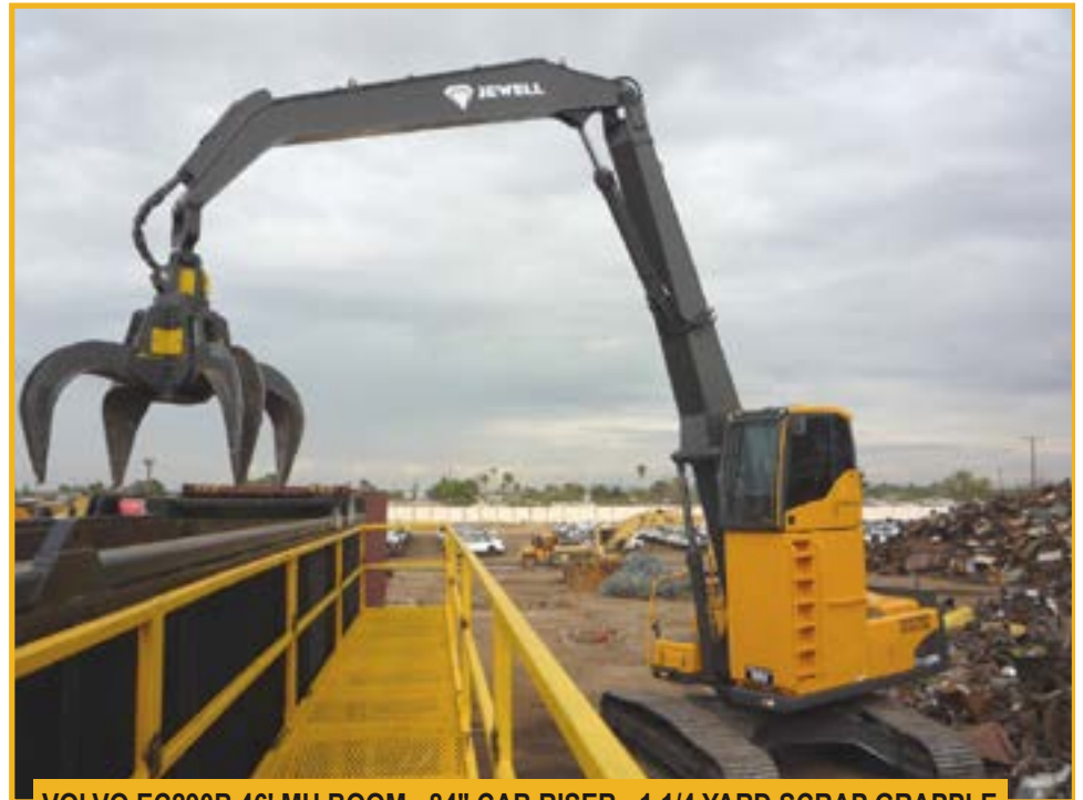
VOLVO EC290B 46' MH BOOM - 84" CAB RISER - 1 1/4 YARD SCRAP GRAPPLE

Whether your job requires reliably handling scrap or demolition material, Jewell can build a machine or attachment to meet the task.