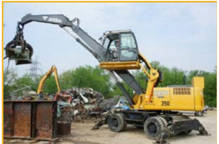
DEERE 220D ' MH BOOM - CAB RISER - 3/4 YARD SCRAP GRAPPLE