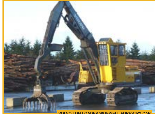
VOLVO LOG LOADER W/JEWELL FORESTRY CAB