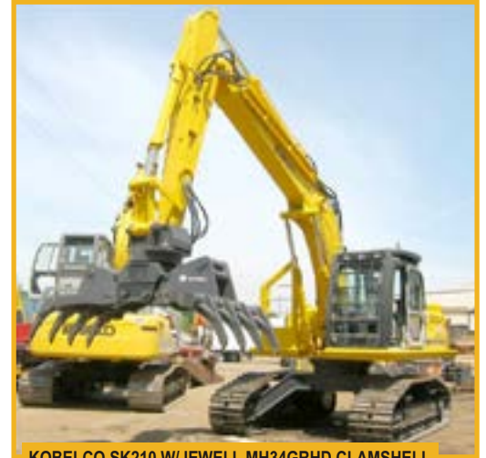
KOBELCO SK210 W/JEWELL MH34GRHD CLAMSHELL