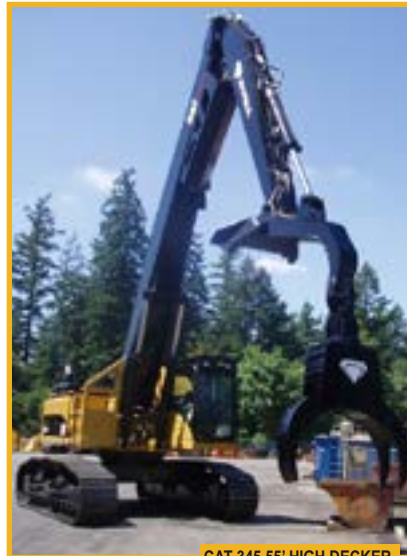
CAT 345 55' HIGH DECKER