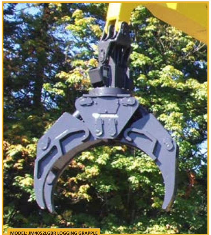
MODEL: JM4052LGBR LOGGING GRAPPLE