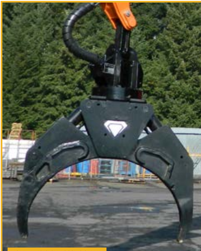
MODEL: JM4058LGBR LOGGING GRAPPLE