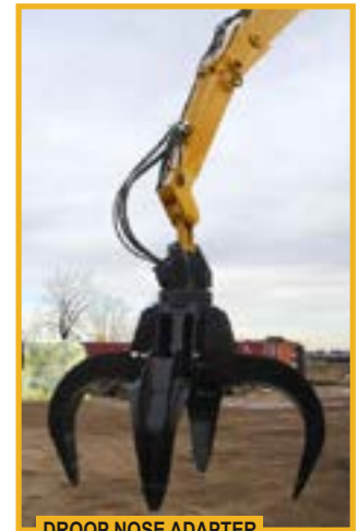
DROOP NOSE ADAPTER