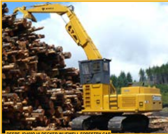
DEERE JD450D HI-DECKER W/JEWELL FORESTRY CAB