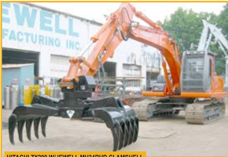
HITACHI ZX200 W/JEWELL MH34RHD CLAMSHELL