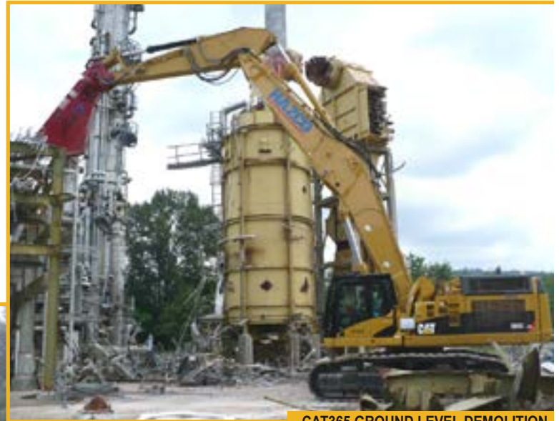
CAT365 GROUND LEVEL DEMOLITION