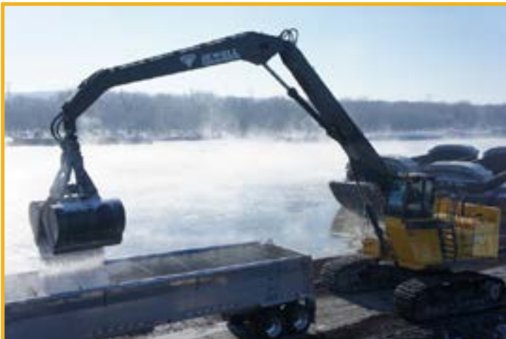
DEERE 650D 60' MH BOOM - CAB RISER & PLATFORM - 4 YARD CLAMSHELL