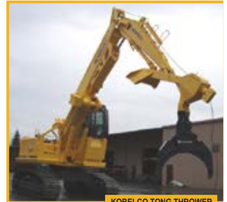
KOBELCO TONG THROWER