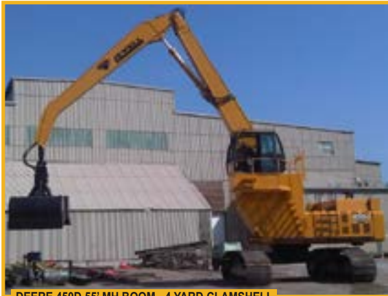
DEERE 450D 55' MH BOOM - 4 YARD CLAMSHELL