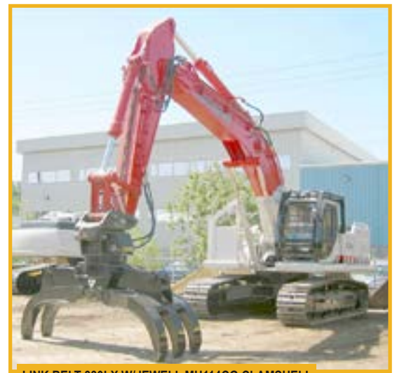
LINK BELT 330LX W/JEWELL MH114CG CLAMSHELL