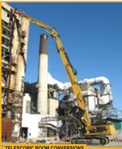
TELESCOPIC BOOM CONVERSIONS