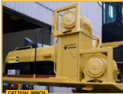
CAT DUAL WINCH