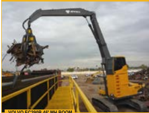
VOLVO EC290B 46' MH BOOM