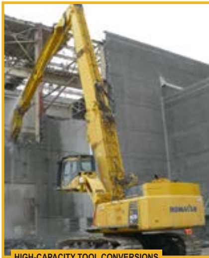
HIGH-CAPACITY TOOL CONVERSIONS