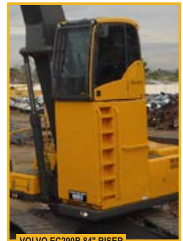
VOLVO EC290B 84" RISER