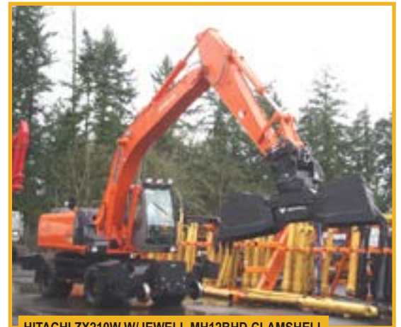
HITACHI ZX210W W/JEWELL MH12BHD CLAMSHELL