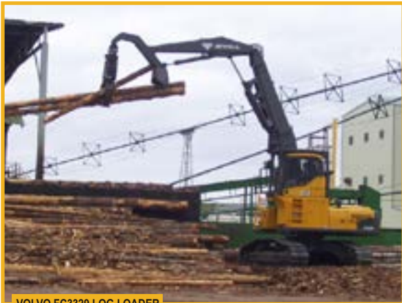
VOLVO FC3329 LOG LOADER