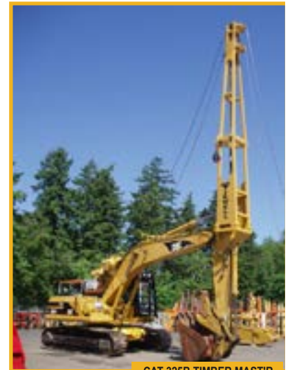
CAT 325B TIMBER MAST'R