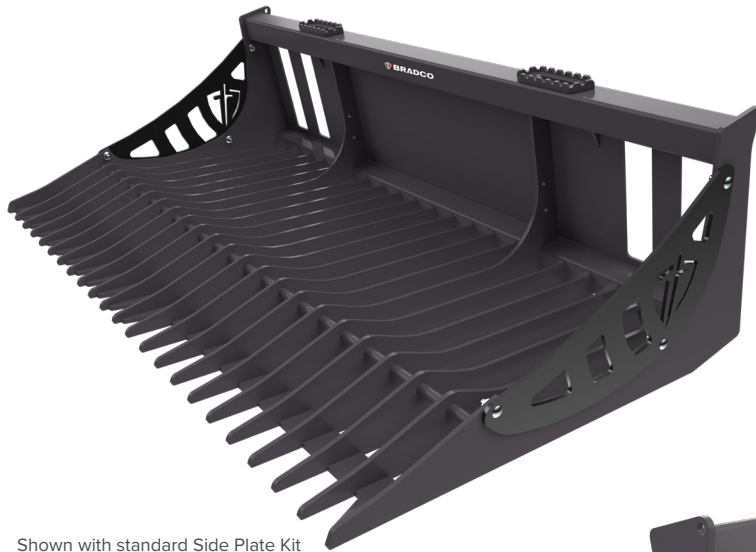
Shown with standard Side Plate Kit