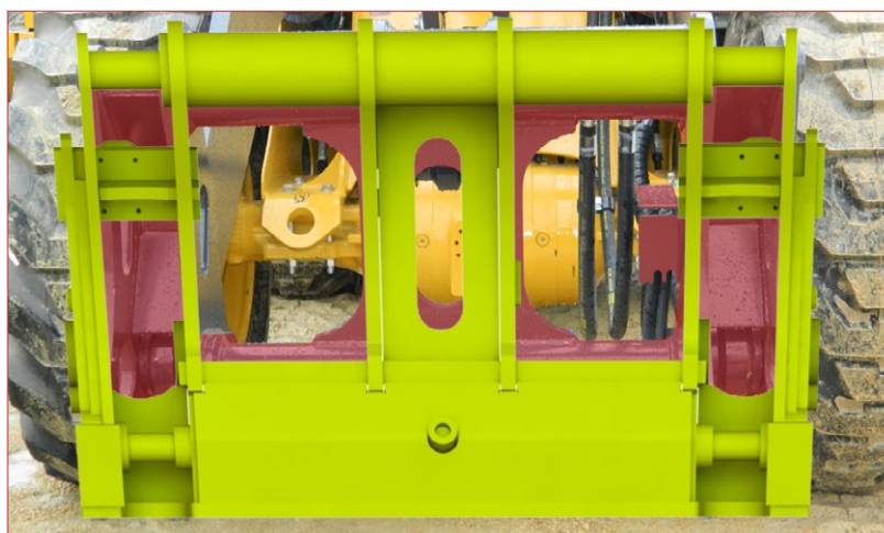
Red Indicates areas of increased visibility Competitor coupler shown in background

The JRB® Extreme Visibility Coupler provides maximum visibility where it matters most. The body of the coupler has been opened up to provide a clear line of sight when working with forks or connecting to attachments to get the job done quickly and safely.