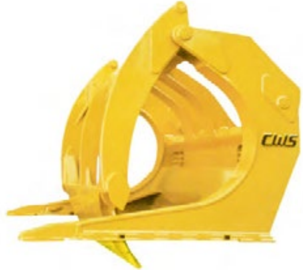
SHORTWOOD GRAPPLE WITH OVERARM